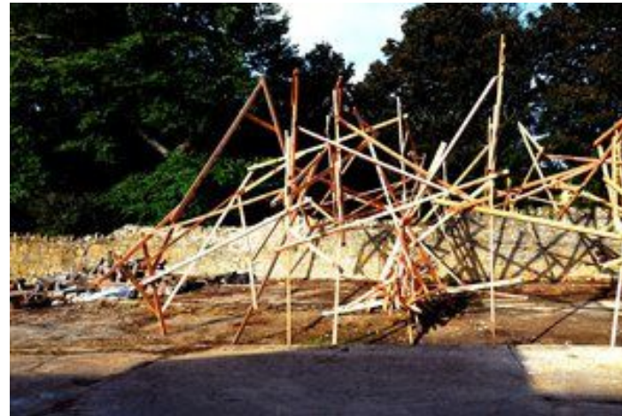
Invisible Architecture: Studio in the Woods Experimental Workshops