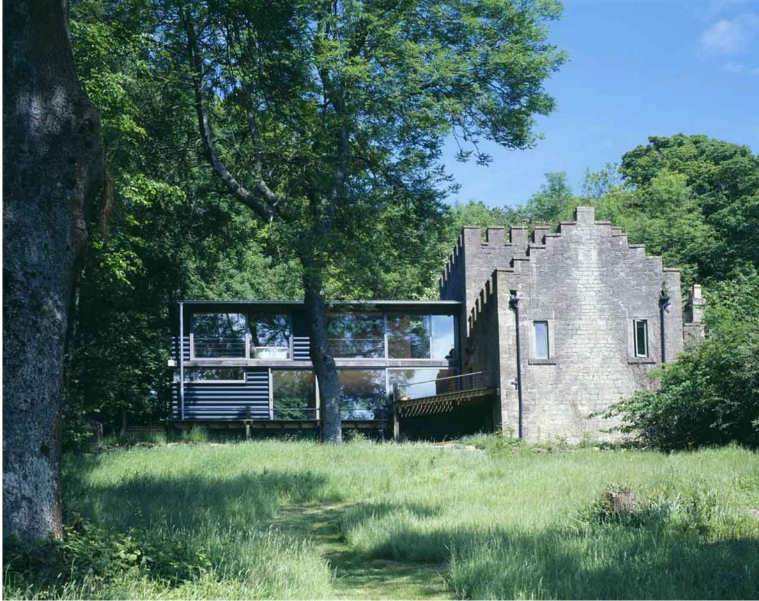
Invisible Studio Moonshine - Architect's self build home and studio in West Country woodland