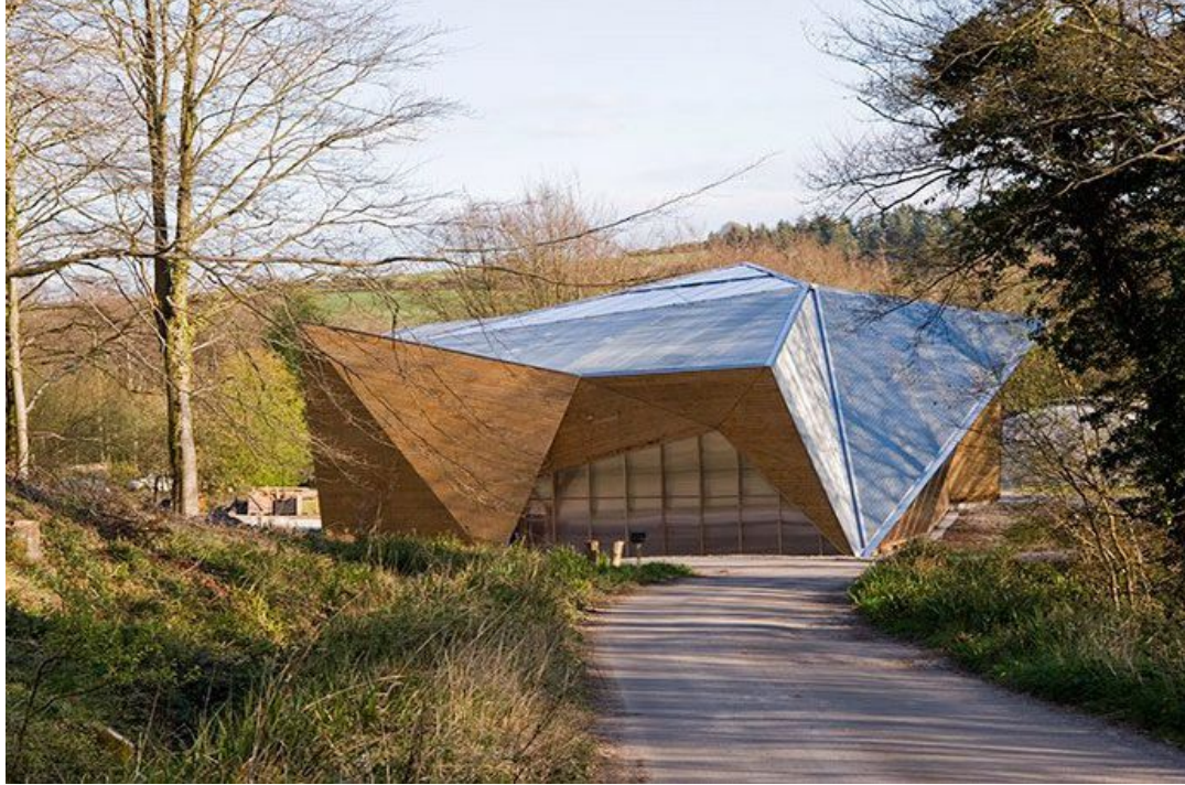
Invisible Studio & Xyolotek Big Shed Hooke Park - timber construction