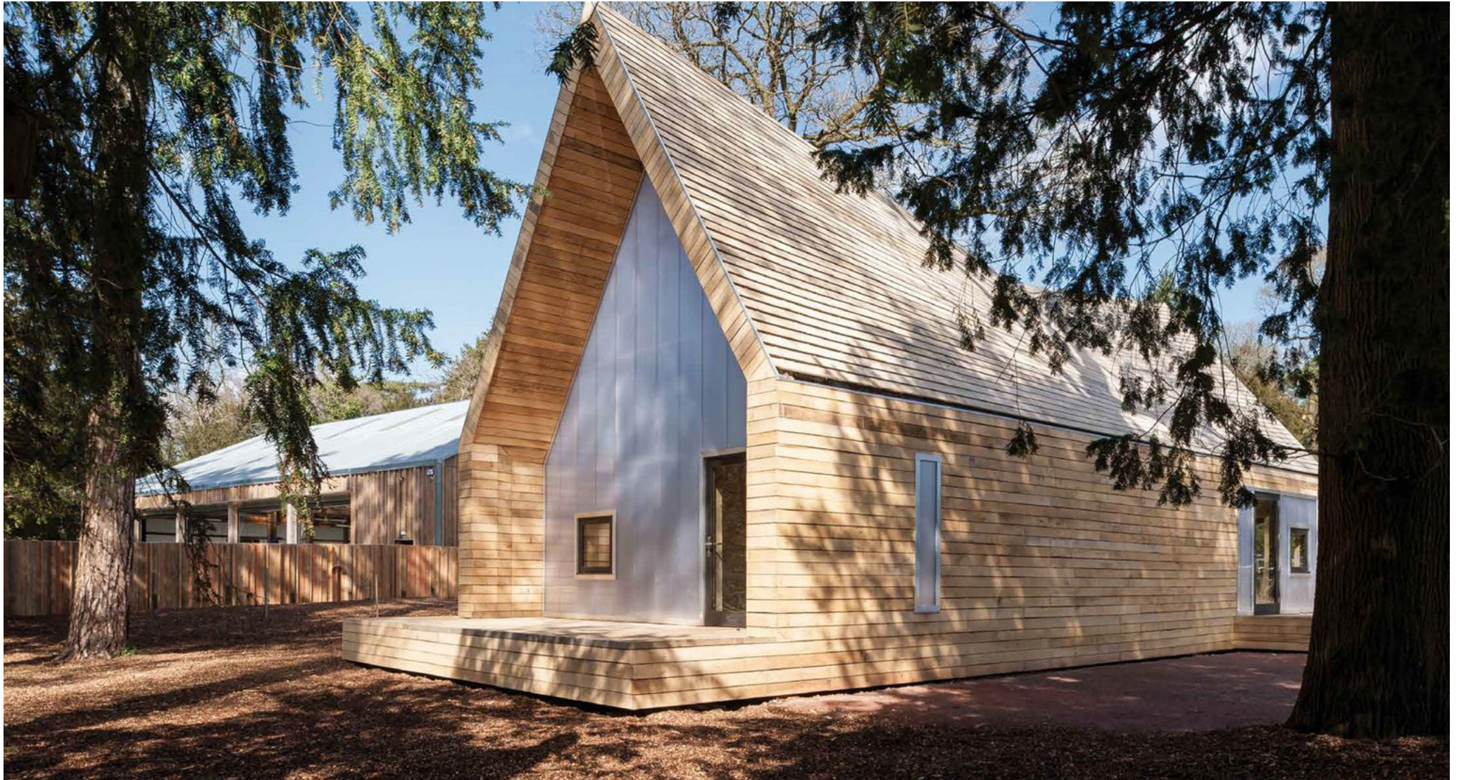
Invisible Studio & Xyolotek - Westonbirt Arboretum Wolfson Tree Management Centre (machinery store and staff facilities) built by volunteers using local timber using local timber.