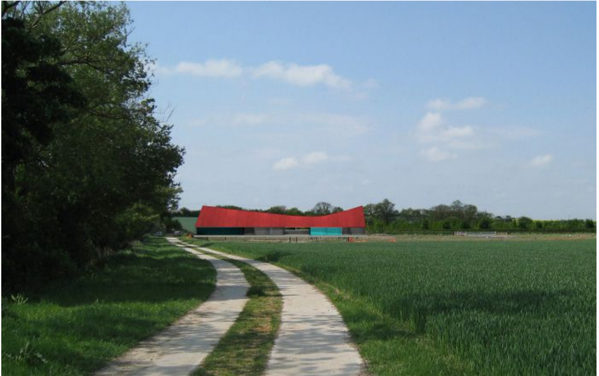
Mole Architecture Coton Country Park Cambridgeshire Low tech and simple visitor centre building