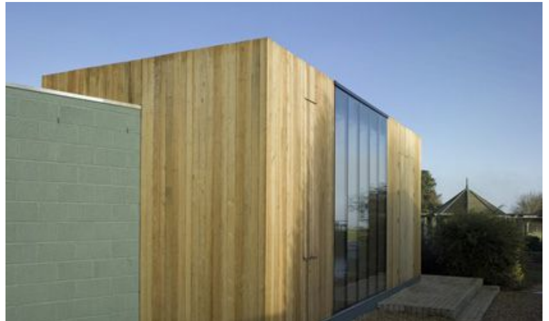
Invisible Studio & Xyolotek Colerne School Dining Hall Somerset